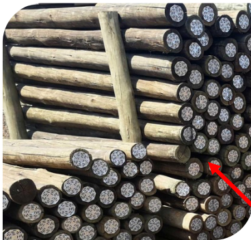
Nail plates identified on all poles to be sold

Identifying a real vs fake pole can be easy as identifying them at point of sale: