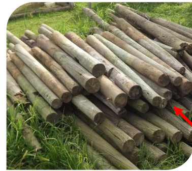
NO nail plates identified on all poles to be sold